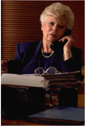
You have succeeded. Your contribution will improve the health of future generations.

A will is the easy and effective means to ensure that you fully provide for your family and that your assets are distributed as you wish. Gifts by will, or bequests, both large and small are important to