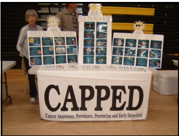
Students from Chaparral Jr. High learn from CAPPED Sun Safe Display.