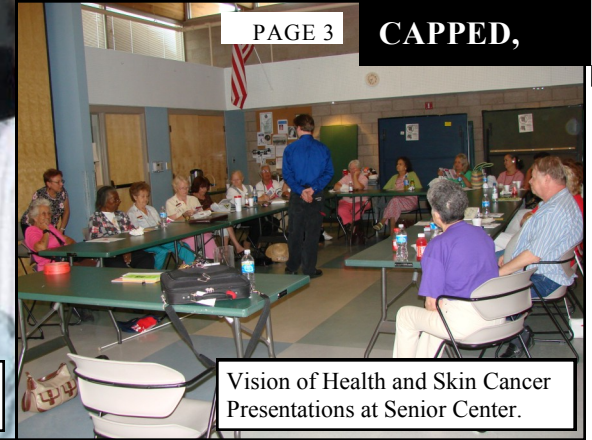
Vision of Health and Skin Cancer Presentations at Senior Center.